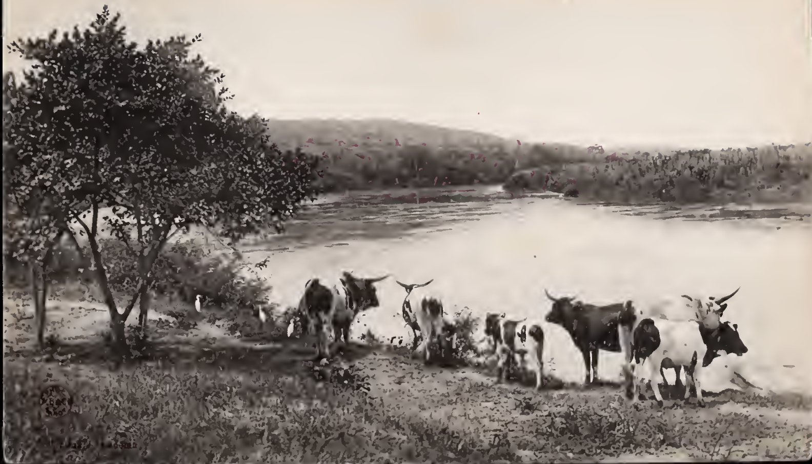
Sur les bords du Niari à Loudima - Congo Français